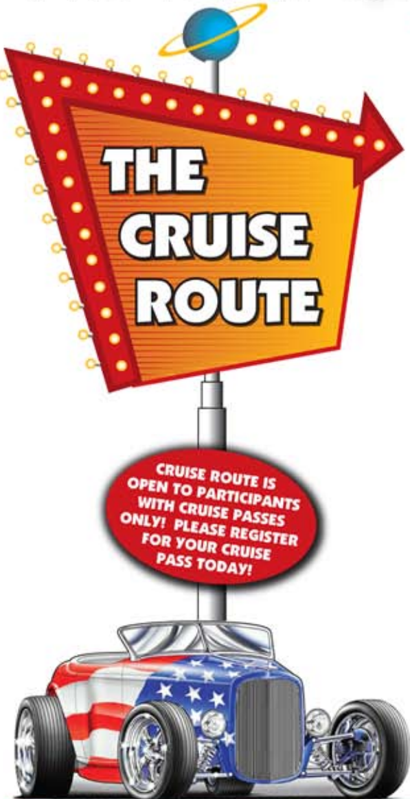
Central Anderson • Cruise Route Map

CAR SHOW REGISTRATIONS AVAILABLE AT: www.HOT-ORAMA.com OR AT ANY OF THE SHOW-N-SHINES